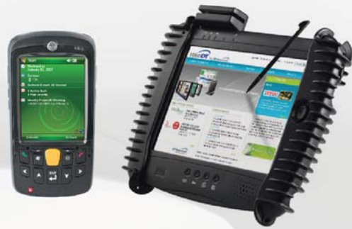
Streamline POS transactions with Motorola handhelds or DT Research Web Pads to provide faster speed of service