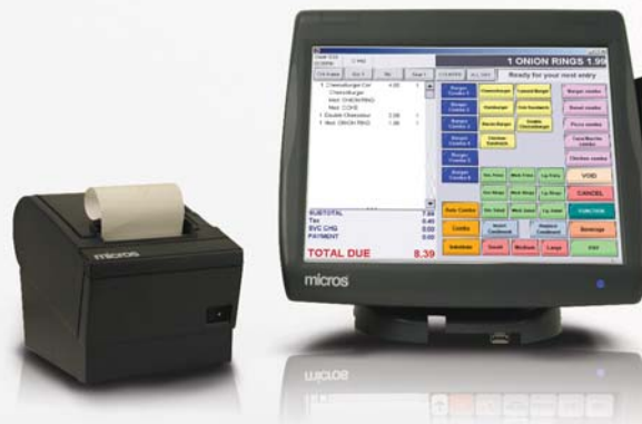
MICROS e7 Point-of-Sale Solution