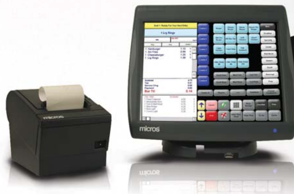
MICROS 3700 Point-of-Sale Solution