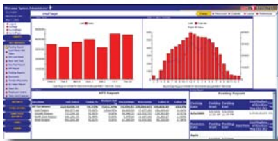
View instant data metrics in real-time.